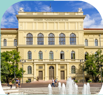
University of Szeged

in an international consortium of six partners: