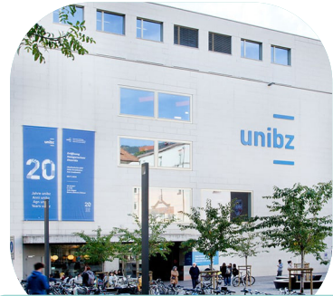
Libera Università di Bolzano