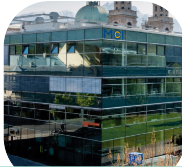
Management Center Innsbruck